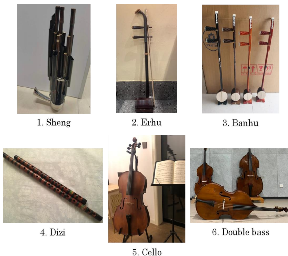
Figure 3. Musical instruments used for singing accompaniments