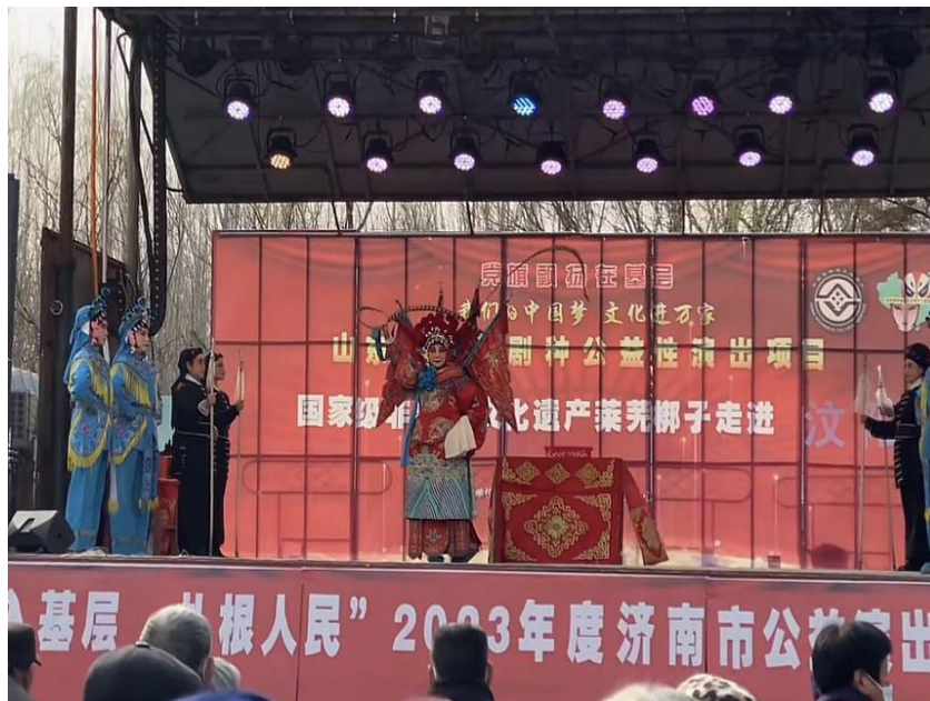
Figure 4. The Laiwu Bangzi Opera performing show in the community

The works of Laiwu Bangzi Opera have achieved a lot of innovation and development in recent years, and the audience's emotions and spirits are extremely satisfied and relaxed. The use of local accent in Laiwu Bangzi Opera makes the audience feel more intimate, and the plot of the story told is close to life and comes from life, making the audience feel as if they are on the scene when watching. Laiwu Bangzi Opera is a bridge for people to better carry out social entertainment activities. It reproduces the knowledge in books directly in front of our eyes, which is very real. The makeup and performance of different characters have their own arrangements and settings, and actors with different roles have different languages and movements on the stage. Laiwu Bangzi Opera has also fully absorbed the characteristics of Chinese classical aesthetics that focus on freehand brushwork. It has the function of cultivating sentiment and enlightening wisdom and improving people's aesthetic taste. It also has a communicative function, as young boys and girls often communicate implicitly and express affection through cooperation, becoming a carrier of communication between the opposite sex.