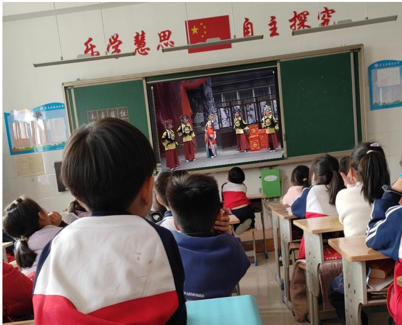
Figure 5. The Laiwu Bangzi Opera performing shows that in classroom

Yang Shangkun and other party and state leaders. In 1975, he performed "Three Ding Pile" as a gift to Jinjing to celebrate the 26th anniversary of the founding of the People's Republic of China. In 1977, "San Ding Pile" went to the Canton Fair to perform for friends from 130 countries and regions. In early 1982, Laiwu Bangzi Opera is a representative music art in Laiwu, Shandong. It has become an indispensable spiritual and cultural activity for people and has been passed down for generations. On June 7, 2008, Laiwu Bangzi Opera was included in the second batch of national intangible cultural heritage list. Through the study of Laiwu Bangzi Opera, we can gain an in-depth understanding of the history of cultural and artistic development in the Laiwu area and encourage more young people to learn and enrich its connotations. This chapter introduces the function of Laiwu Bangzi Opera to Laiwu society, mainly through entertainment function and education function. Through the introduction of various functions of Laiwu Bangzi Opera, we can gain a deeper understanding and positioning of the role of Laiwu Bangzi Opera in Laiwu society which guards the inheritance and protection of Laiwu Bangzi Opera.