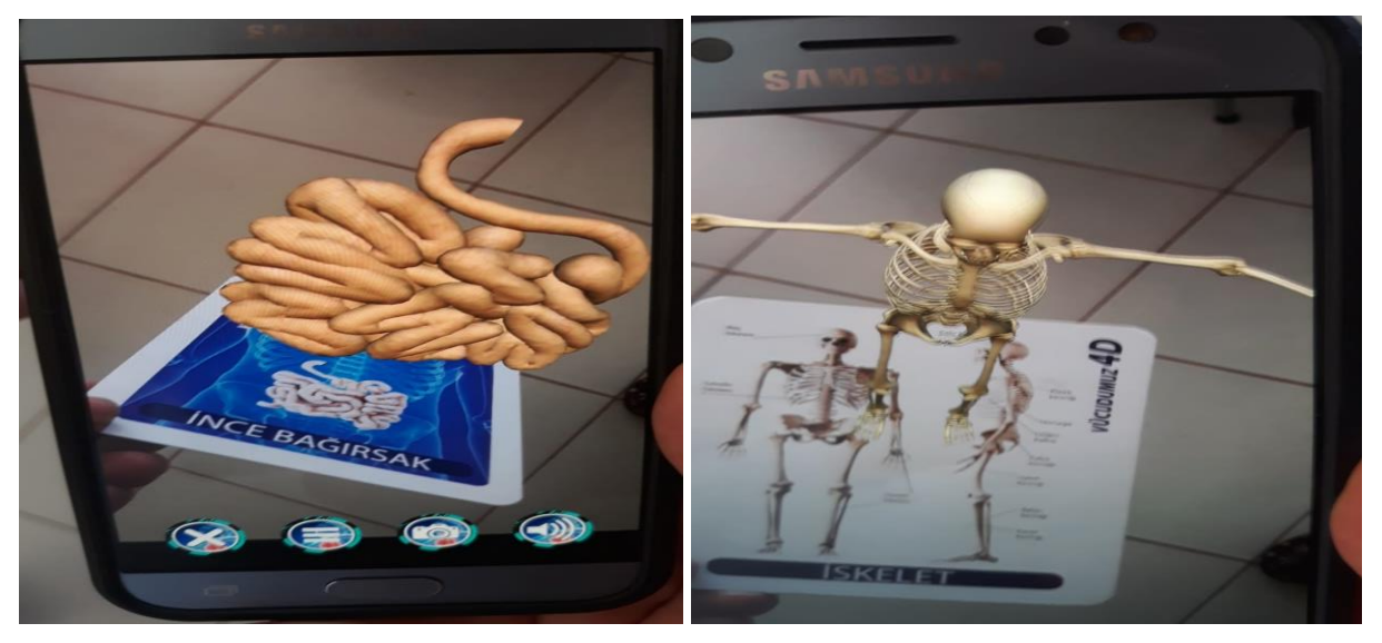
Figure 2. Example of AR implementations where two-dimensional pictures are seen in three dimensions

implementations of augmented reality make them more understandable by concretizing the difficult and at the same time abstract subjects, are also remarkable.