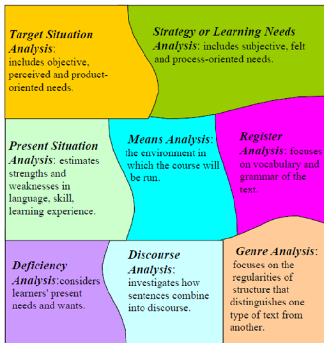
Figure 1. Needs analyses jigsaw (Songhori, 2008, p. 22)

points of view to this issue during these debates. Considering all these different types of needs analyses complementary rather than exclusive, Mehdi Haseli Songhori compares each different type of needs analyses to a piece to complete a jigsaw.