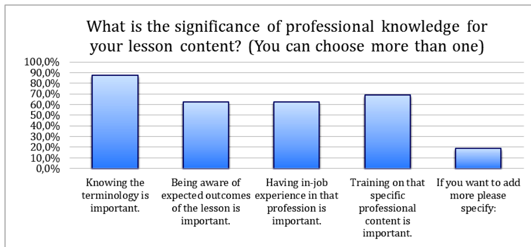
Figure 2. Significance of vocational knowledge for the content of vocational English subject

With regards to the significance of vocational knowledge for their lesson content, %62.5 of the instructors think that having in-job experience in that vocation is important and %68.8 of them think that training on that specific vocational content is important. One of the instructors also specified that being personally interested in that vocation is important, too.