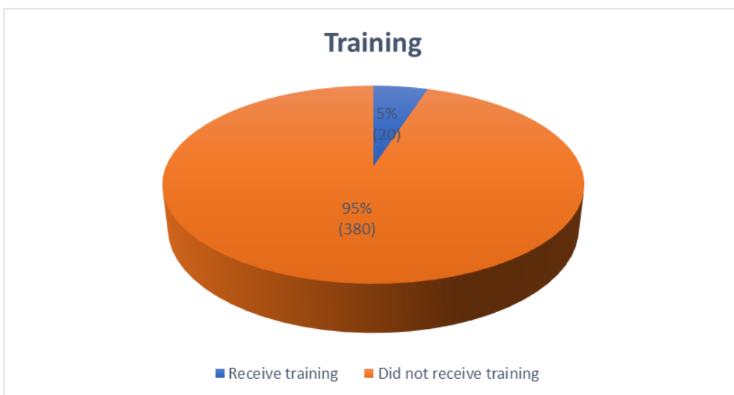
Figure 2. Teachers' training on dyslexia

According to Figure 2, only 5% of the teachers stated receiving training on reading difficulties. All those who did receive training stated that it was insufficient.